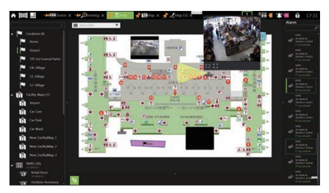
GVD "Facility Maps"