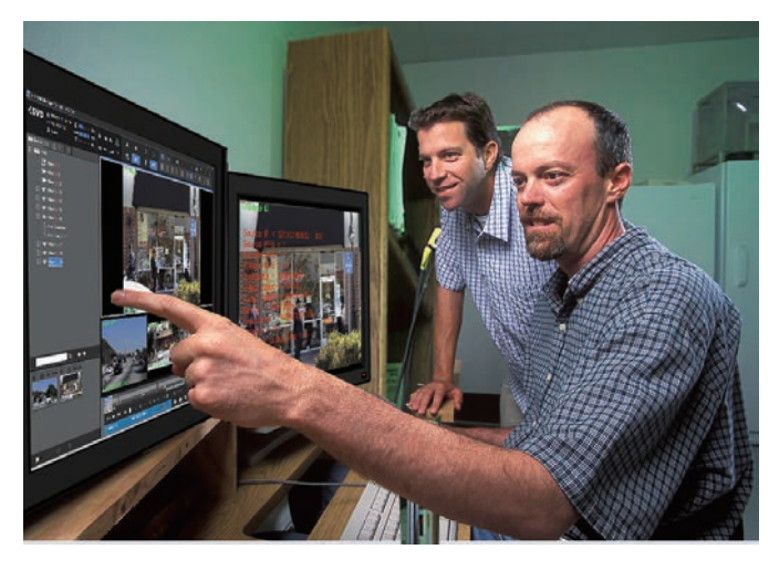
UVV Kassen - compliant "Four-eye Principle"