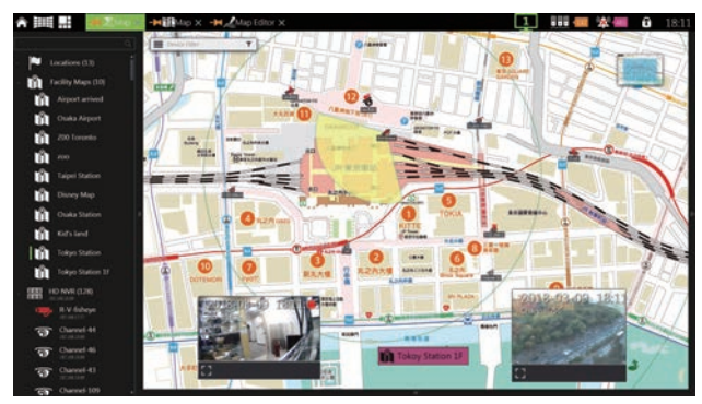
GVD GIS Maps

To ease the complexity of banking security, GVD features GIS Maps and Facility Maps ("floor plans"). The security operators can efficiently oversee and manage a great number of devices on a nation-wide landscape and quickly respond to an alarm by instantly spotting the relevant device on-map.